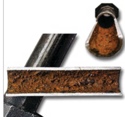
This actual cutaway of black iron compressed air piping shows typical contaminant build up and flow restriction after just a few years of operation.