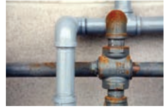
Black and galvanized iron