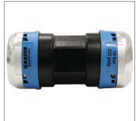
Robust valves and fittings for ease of installation and minimized pressure losses.