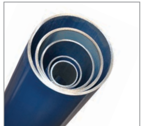
Rigid aluminum calibrated pipe ensures clean air and optimum flow rate performance.